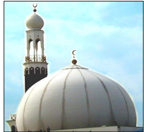
The dome – The Minaret

The Birmingham Central Mosque is open to visitors throughout the year. We receive a large number of visitors from schools, colleges, universities and other institutions wishing to find out more about a mosque and the Islamic faith for projects and studies.